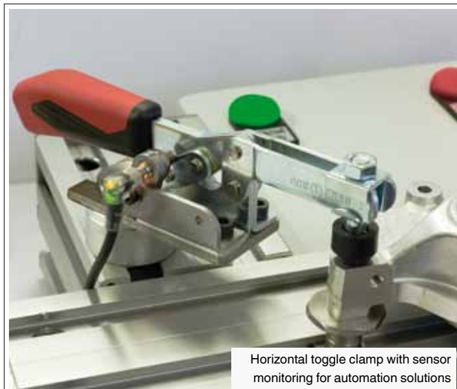
Horizontal toggle clamp with sensor monitoring for automation solutions