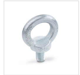
ROSTFREI Inox Stainless Steel