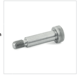
ROSTFREI Inox Stainless Steel