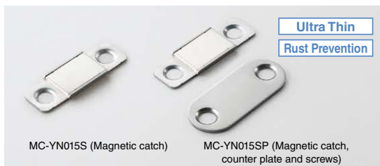
MC-YN015S (Magnetic catch)