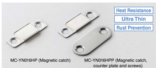
MC-YN016HP (Magnetic catch)